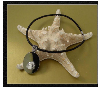
Inch-sized 8 Ball snuggles along the shimmery gold & black division line of Paua Shell on this 2.5" pendant. With a 16" braided black leather cord

Pups Without Partners 39 Wharton Street West Haven, CT 06516